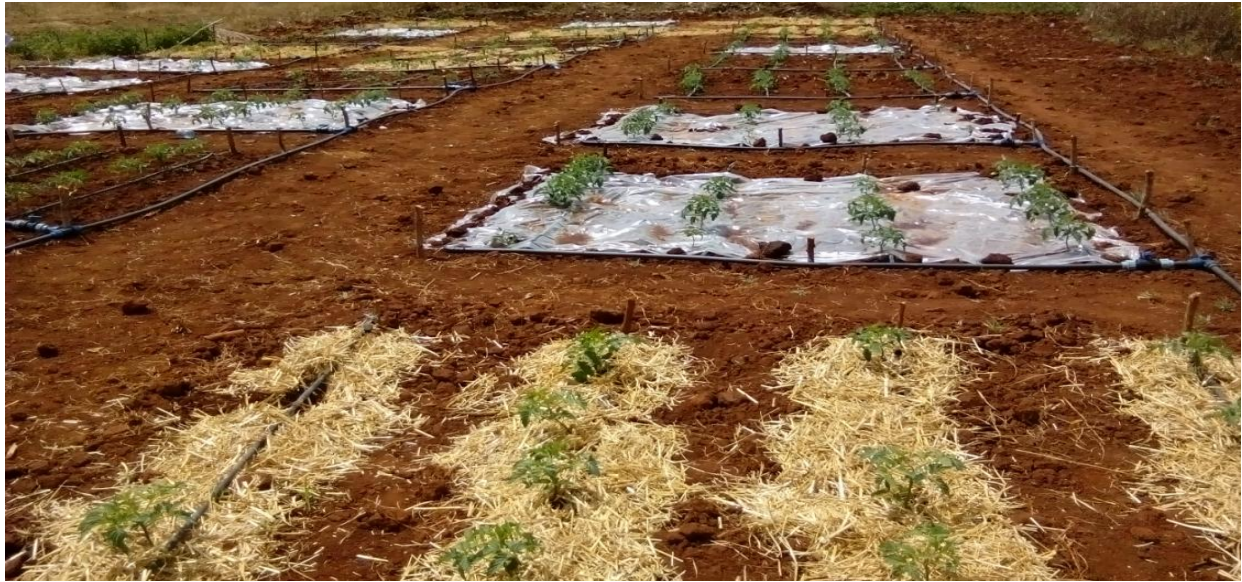
Fig.2 Pictures of No Mulch (NM), Straw Mulch (SM), and white plastic Mulch (WPM) of treatment