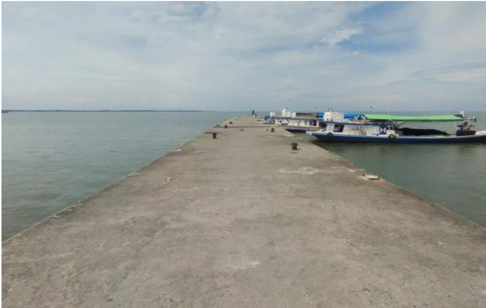
Fig.4 PPI Pontap Port Pool