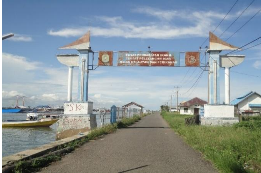
Fig.6 PPI Pontap Fish Collection Place.