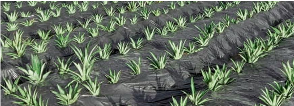
Fig.3 Double row planting system of Pineapple.